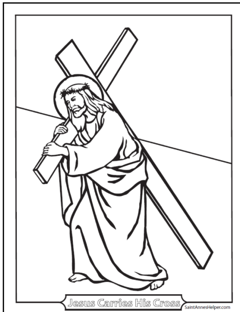
Jesus Carries His Cross

Jesus said to his disciples. "Do this in remembrance of me."