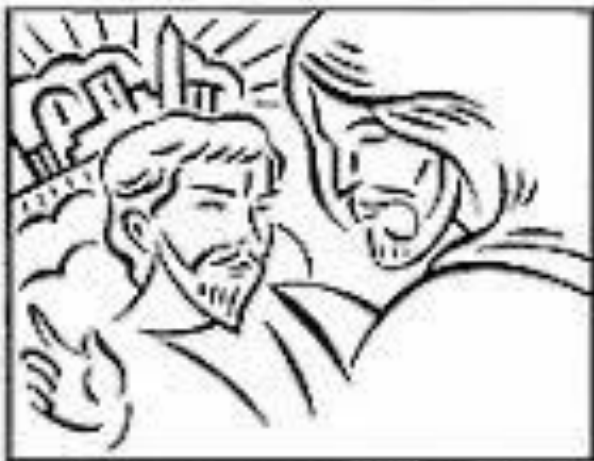
Then Jesus was led by the Spirit into the desert to be tempted by the devil. Matthew 4:1 (NIV)

God of the desert, as we follow Jesus into the unknown, may we recognize the tempter when he comes; let it be your bread we eat, your world we serve and you alone we worship; we ask this through Christ our Lord. Amen.