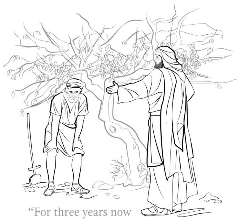
I've been coming to look for fruit on this fig tree and haven't found any."