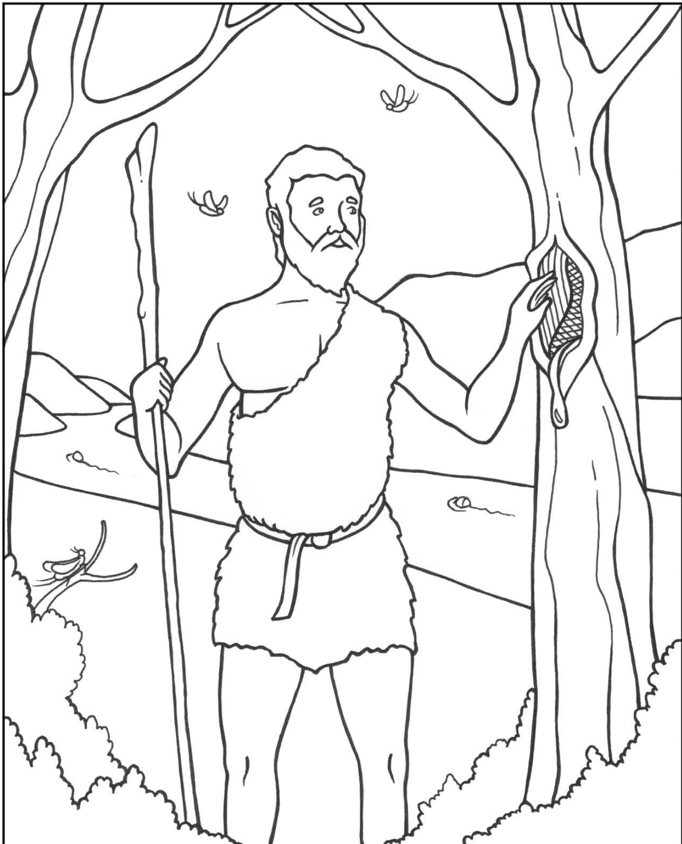
St. John the Baptist