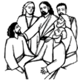
Calling the Twelve to him, he sent them out two by two. Mark 6:7 (NIV)

Each number represents a letter of the alphabet. Substitute the correct letter for the numbers to reveal the coded words.