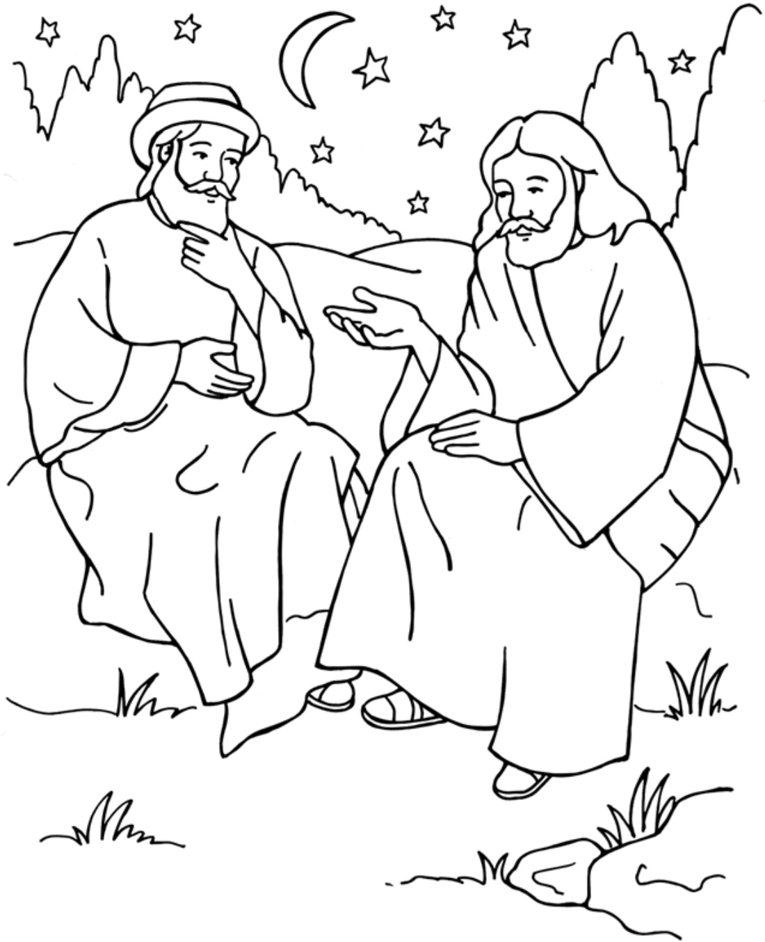
Jesus and Nicodemus