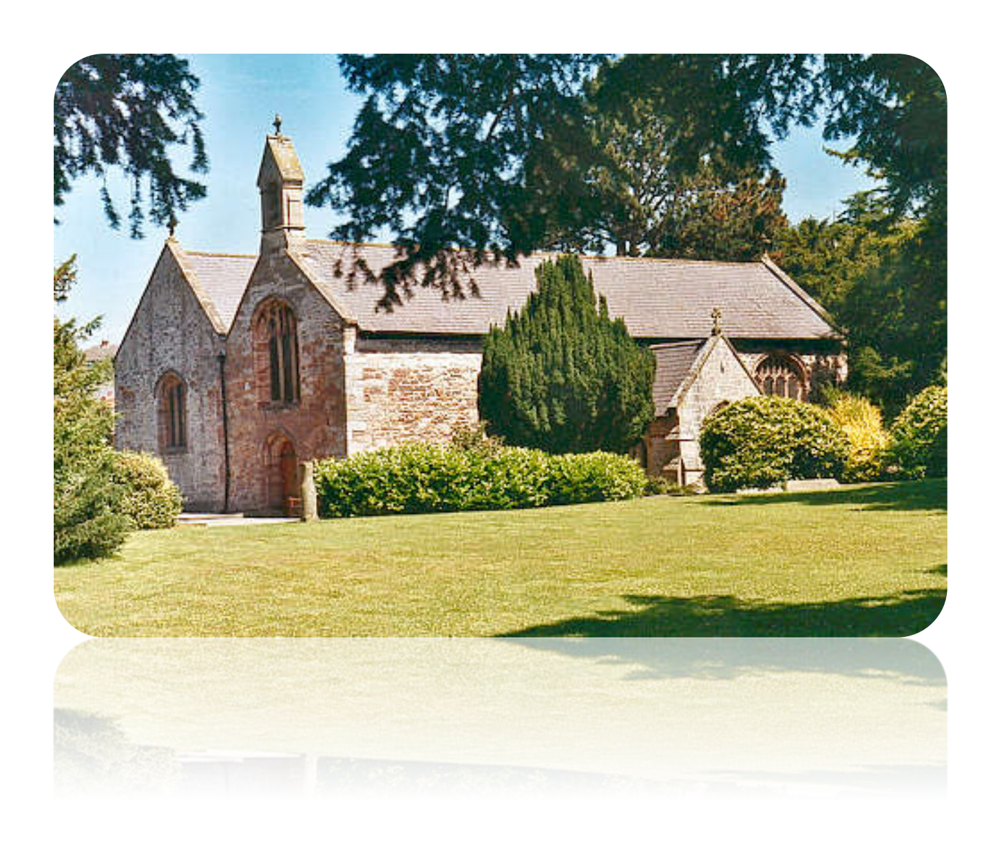
ALL-AGE EUCHARIST FOR MOTHERING SUNDAY